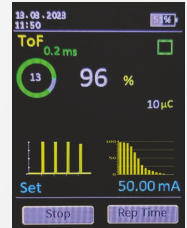
TOF + Trend Graph

• Specifications and design subject to change without notice